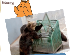
Let's try bear's skill