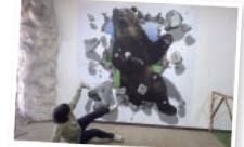
Trick art photo