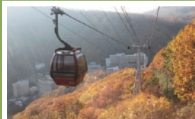
Spectacular view during the autumn foliage season!

A unique gondola is in operation which hangs salmon on the gondola and dries them in the cold to make salmon jerky (Visitors are not allowed to ride on the gondola). The dried salmon jerky is used as feed for the bears.