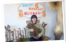
Discover how big a cub bear can be!

The museum exhibits numerous materials including mounted bears by age group from the first day of life to adult as well as skeletal specimens, the origin and history of bears, their habits and ecology, their distribution around the world, and the damage caused by humans and livestock.