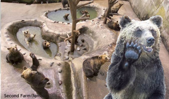
Second Farm (female)